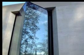
Adaptive glazing ratio dependent on solar access