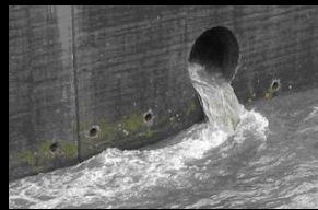
Reduce Stormwater discharge