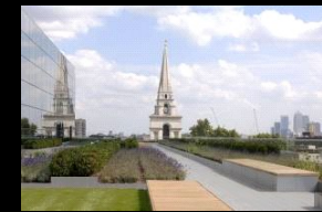
Public sky garden with panoramic views of city