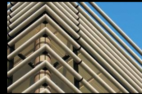
Adaptive solar shading