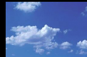
Maximise views from street level