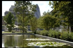
Create public spaces